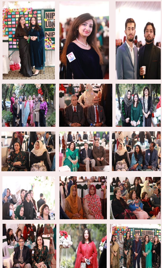
tableau performances, funny skits, mimes, cultural walk, and poetry. The audience also enormously enjoyed the instrumental music and songs; while senior alumni shared their throwback and nostalgic memories of NIP.